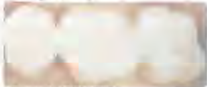
Composite White Fillings

This image shows how the amalgam and composite filling differ looks wise and shows why people may prefer the composite over the amalgam due to its colour.