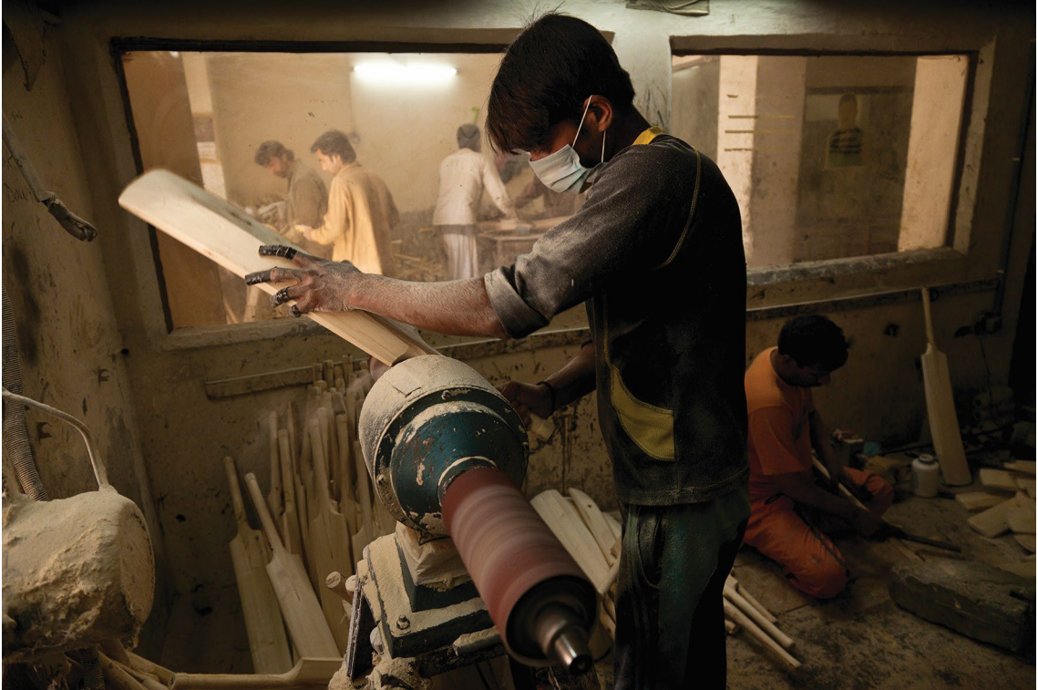
Figure 2 Photograph showing a cricket bat factory in Sialkot